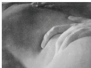
Benjamin Verhoeven Sculptural Movement: Chapter I & II , 2016 Edition of 3 + 2 AP video; 12 minutes, 8 seconds