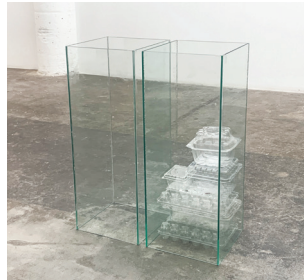
Wim de Pauw How to disappear (in America) , 2019 glass, plastics 33.5 x 12.25 x 33.5 in each