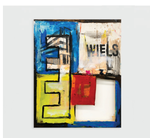
Michiel Ceulers Sir Robert's Faux Opening (Rapport Vroom Vroom) , 2021 oil, acrylic, gloss paint, and gummies on canvas and tow bag 31.5 x 25.5 in