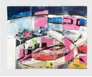
Michiel Ceulers Schlürfend aus einem Feuerwehrschauch / when the world is flooded dance in the rain , 2021 oil, acrylic, glitter, perspex, silicone, and styrofoam on canvas 31.5 x 39.5 in