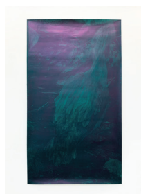
Birde Vanheerswynghels untitled , 2016 phthalocyanine green pigment on paper 103 x 59 in