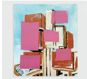
Michiel Ceulers Dans les tubes du Gug- genheim (le dernier espoir de la romance picturale) , 2021 acrylic and perspex on canvas and board 28 x 22.25 in