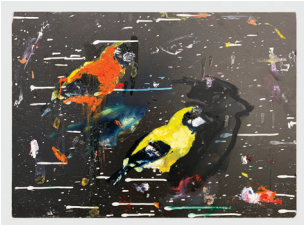
Michiel Ceulers An attempt to distance "painting" from the hege- mony of its image , 2021 oil, encaustic, gloss paint, liquin, and glitter on wood 20 x 27.5 in