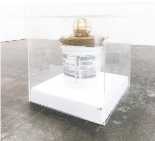
Michiel Ceulers Filme aus meinen Leben blitzen vor mir auf , 2021 bucket, cardboard, plexi- glass, styofoam, tape, wire 25 x 22.5 x 20.5 in