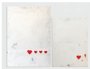
Michiel Ceulers Minenfeld für Rezensionen / eine Lehrstunde in Liebe (die Großzügigkeit der anderen) , 2021 oil, encaustic, spray paint, gummies, and glitter on canvas on board 30.3 x 40 in