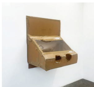
Michiel Ceulers Denkmal/incubator , 2021 cardboard, paper, plastic, tape 49 x 42.5 x 20.5 in.