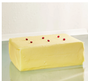
Kasper Bosmans Dwarf Parade Dog (Ruby Nipples) , 2018 butter, rubies 1.75 x 6.5 x 3 in