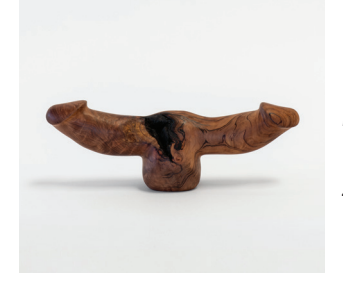
Isabelle Albuquerque Double Olisho, 2020 Redwood with burnt void 4 x 12 x 2.75 in