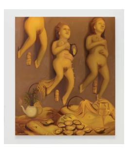
Dominique Fung Female Heirs, 2020 oil on canvas 72 x 84 in