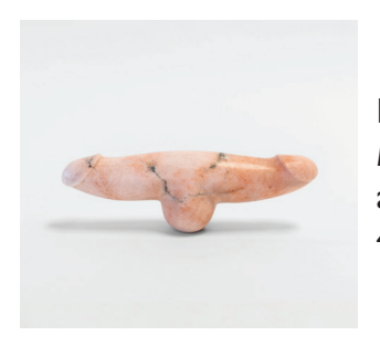
Isabelle Albuquerque Double Olisho, 2020 alabaster 4 x 12 x 2 in

Nicodim Upstairs • Los Angeles Decmber 12, 2020 – January 30, 2021