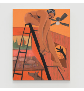
Katja Farin Shadowed Ladder, 2020 oil on canvas 20 x 16 in