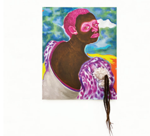
Simphiwe Ndzube Nombewu, the Seed , 2021 acrylic, fabric, and synthetic hair on canvas 30 x 24 in 76 x 61 cm