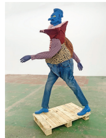
Simphiwe Ndzube TaBhiza, The Flâneur , 2021 concrete, metal, resin, silicon, fabric, shark teeth, thread and found clothing 81.5 x 26 x 48 in 207 x 66 x 122 cm