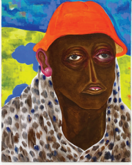
Simphiwe Ndzube Magwaza , 2021 acrylic and collage on canvas 20 x 16 in 51 x 41 cm