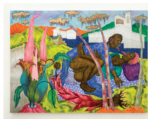
Simphiwe Ndzube Once Upon a Time, Mine-Moon , 2020 acrylic, duct tape, and spray paint on linen 72 x 96 in 183 x 244 cm