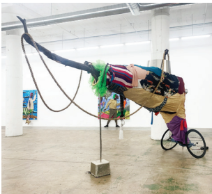
Simphiwe Ndzube Beast of No Nation , 2021 fabric, fog machine, resin, wood, metal, rope, motorbike lights, found clothing and tires dimensions variable