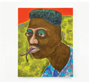
Simphiwe Ndzube Neon Vernacular , 2021 acrylic and collage on canvas 20 x 16 in 51 x 41 cm