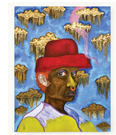
Simphiwe Ndzube Portrait of Daluxolo , 2021 acrylic, collage, and spray paint on canvas 51 x 39.5 in. 129.5 x 100.3 cm