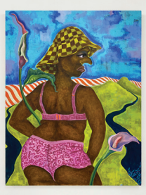
Simphiwe Ndzube Notumato , 2021 acrylic and collage on canvas 39.5 x 30 in 100.33 x 76.2 cm