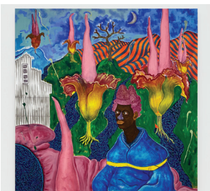
Simphiwe Ndzube Goddess of the Night, Glory of the Stars , 2021 acrylic, collage, duct tape, and spray paint on canvas 72 x 72 in 183 x 183 cm