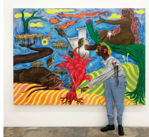
Simphiwe Ndzube The Return from Heaven , 2021 acrylic, collage, spray paint, resin and found clothing on canvas 90.5 x 96 in 229.9 x 243.8 cm