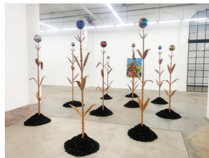
Simphiwe Ndzube Secrets of the Fields , 2021 metal, clay, gazing ball, and mulch dimensions variable