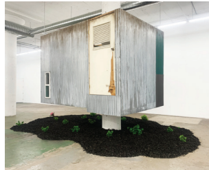
Simphiwe Ndzube Rainbow Nation of God, Cities on the Sky , 2021 sheetmetal, lumber, windows, plexiglass, artificial plants, dirt, found door, and mulch dimensions variable