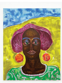
Simphiwe Ndzube Nomalanga , 2021 acrylic on canvas 30 x 24 in 76.2 x 61 cm