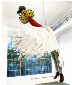
Simphiwe Ndzube I am a Bird Now , 2021 fabric, found clothing, res- in, synthetic hair, synthetic snakeskin, and wire dimensions variable