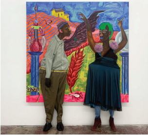
Simphiwe Ndzube Rehearsal for Rebellion , 2021 acrylic, collage, found clothing, resin, and spray paint on canvas 90.5 x 72 in 229.9 x 182.9 cm