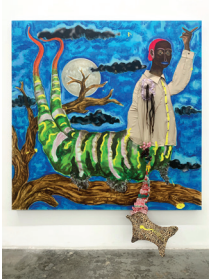
Simphiwe Ndzube Individuation, Manifest , 2021 acrylic, collage, spray paint, fabric, artificial grapes, wire and wood on canvas 72 x 72 in 182.9 x 182.9 cm

Los Angeles December 12, 2020 – January 30, 2021