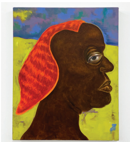
Simphiwe Ndzube Ma Khulu , 2021 acrylic and collage on canvas 20 x 16 in 51 x 41 cm