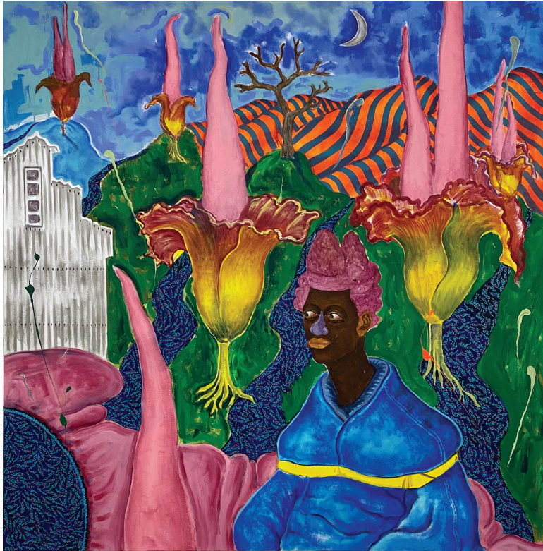
Simphiwe Ndzube, Goddess of the Night, Glory of the Stars , 2021

Los Angeles February 13, 2021 – March 20, 2021