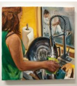
Larry Madrigal Invisible Thoughts , 2020 oil on linen 50.80h x 50.80w cm 20h x 20w in