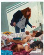
Larry Madrigal Breaking the Snooze , 2020 oil on linen 152.40h x 121.92w cm 60h x 48w in