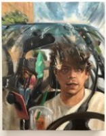
Larry Madrigal Driver , 2020 oil on canvas 50.80h x 40.64w cm 20h x 16w in