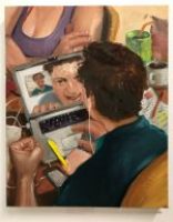
Larry Madrigal Virtual Sincerity , 2020 oil on canvas 50.80h x 40.64w cm 20h x 16w in