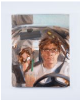
Larry Madrigal Driver (study) , 2019 oil on panel 25.40h x 20.32w cm 10h x 8w in