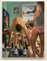
Larry Madrigal Lightweight Superset , 2020 oil on linen 121.92h x 91.44w cm 48h x 36w in